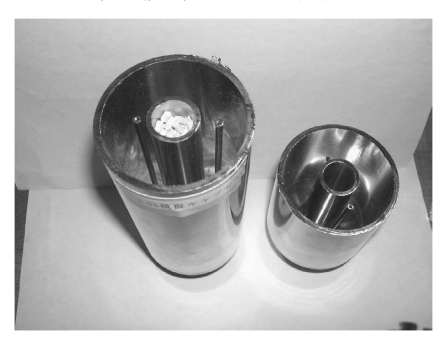
Fig. 3. Cross-section of a mockup of an irradiation capsule for tritium breeder materials. The mockup was cut in a test for trial fabrication of the dismantling apparatus.

(3) It is being investigated that the condition of the cutting position of irradiated capsules is monitored by using a television camera and/or a microphone during the cutting operation.